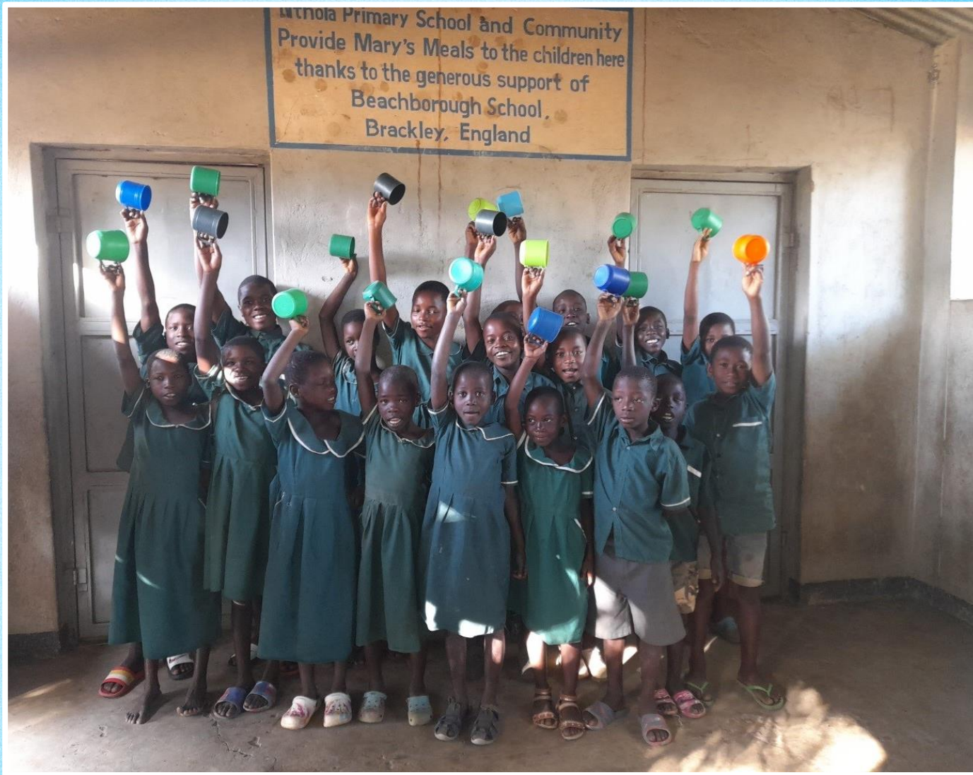
Nthola Primary School, Karonga, Malawi