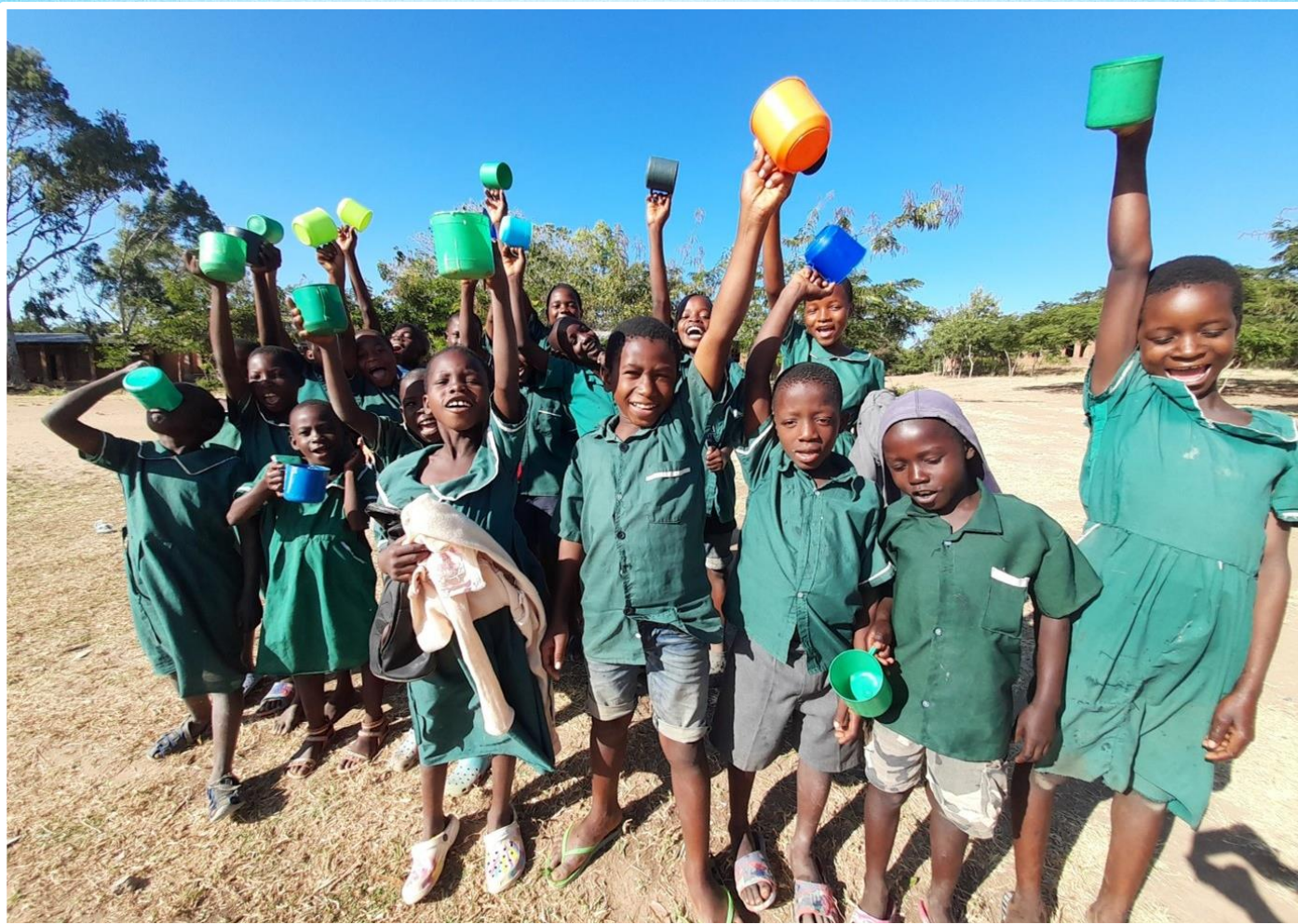
Nthola Primary School, Karonga, Malawi