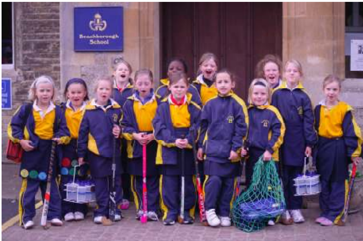
The U8s leaving for their first away fixture

We are still after small toys for the toy stall – things that children can buy themselves with their pocket money! Please put your donations in the named box in the Front Hall and the Boardman.